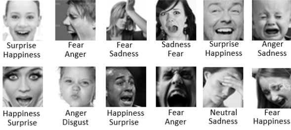
Figure 2: Some samples of the FERPlus dataset.